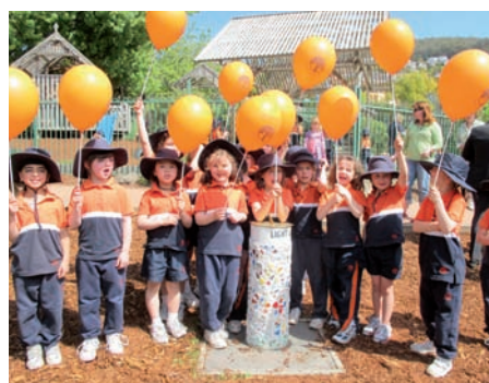
Above: Preps enjoy the unveiling of their beautiful sundial.