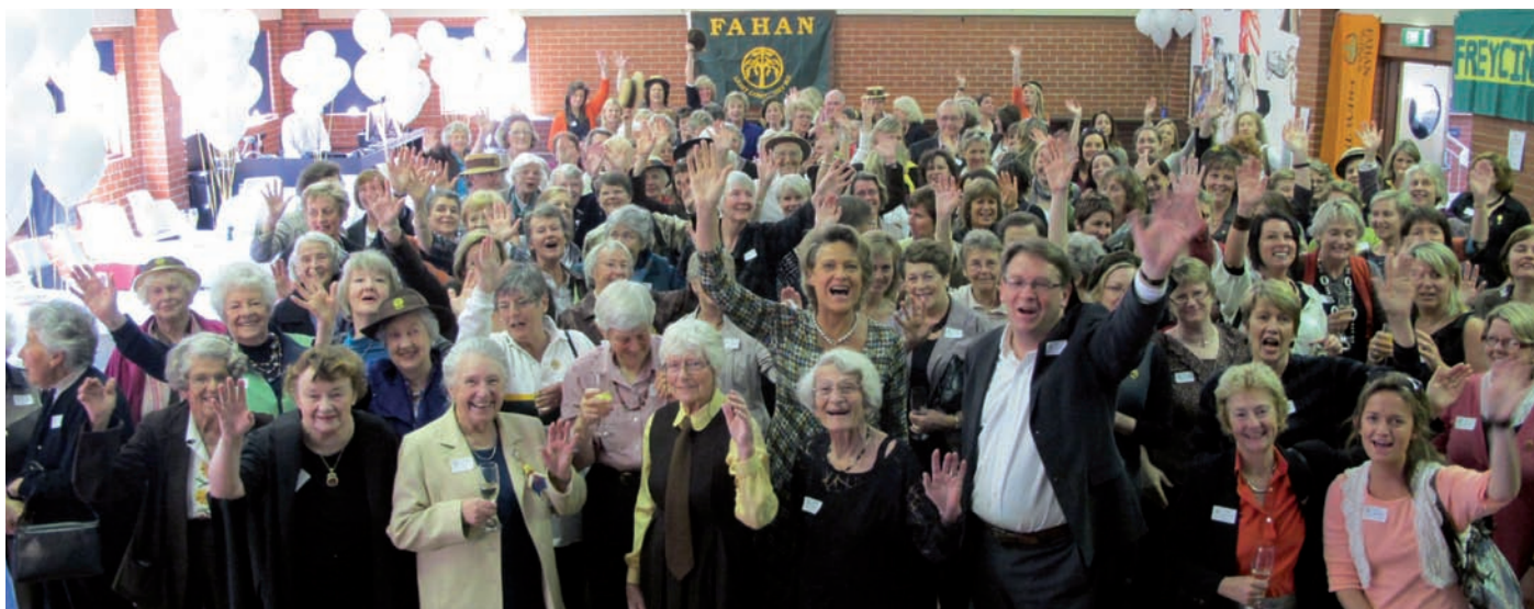
150 former Fahan girls, and boys, mingle with past and present staff at the very successful Alumni 75th Anniversary lunch on Saturday October 2 in the Travers Morphet Hall.