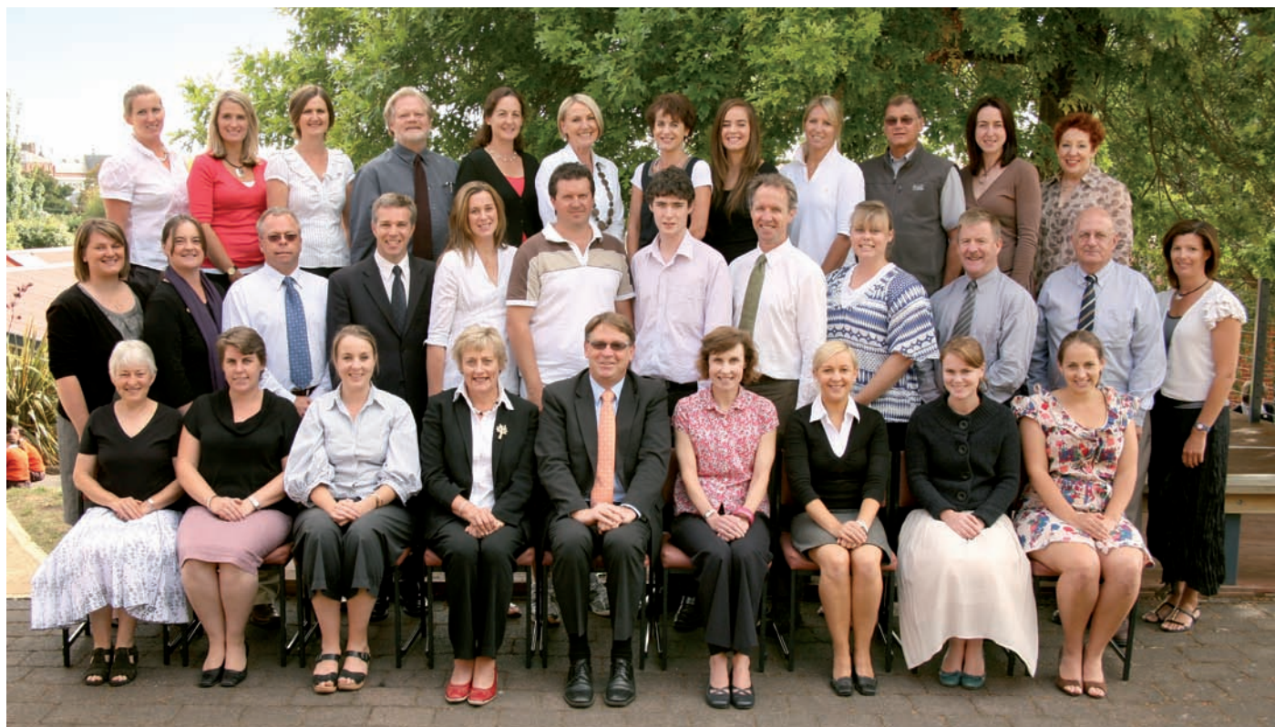
Many of our teaching staff who have worked incredibly hard throughout 2010 to ensure this was one of our students' best years at the School. Congratulations to each of them.