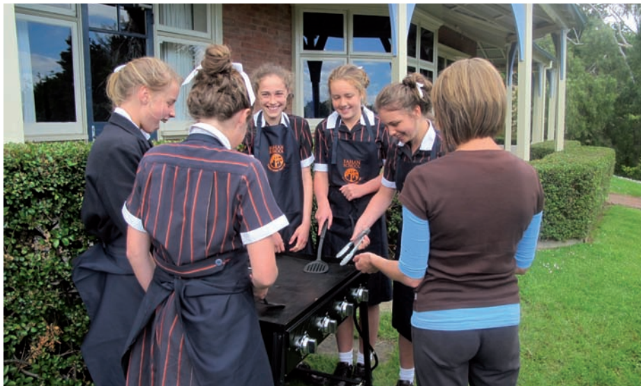
Above: Year 7 students make sure the BBQ is in working order for the final P&F meeting on Tuesday 16 November.