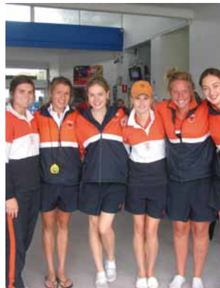
Senior School support at the Junior Swimming Carnival