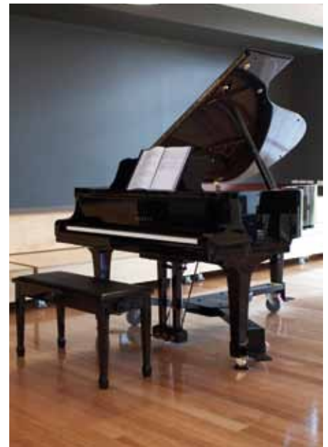
The new grand piano, donated by the P & F

Over the course of each year the P and F Association undertake fundraising and social events to benefit the students, parents