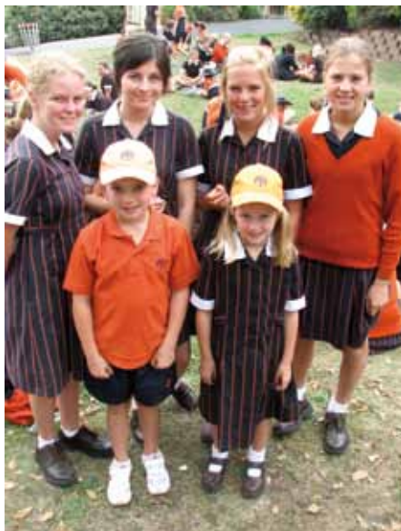
A Fahan 'family' at the Big Sister, Little Sister Easter BBQ