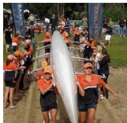
Guard of honour: Senior Rowers at Head of the River