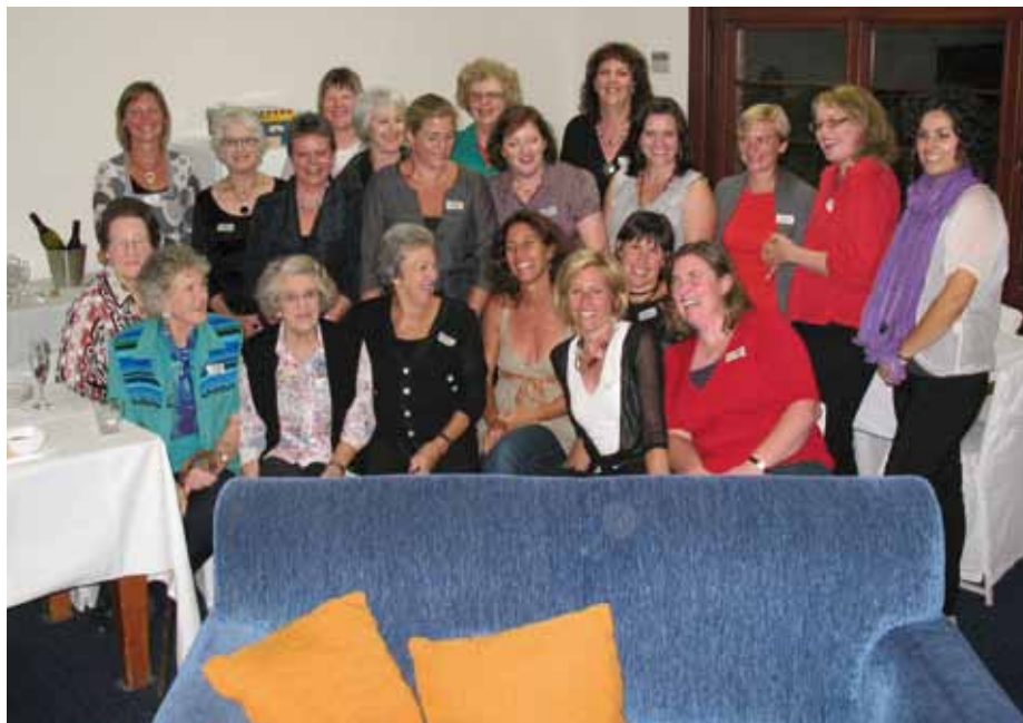
Giggly girls at the Boarders' Reunion